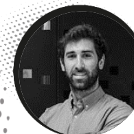
Fernando Alcalá Digital Transformation DATA4